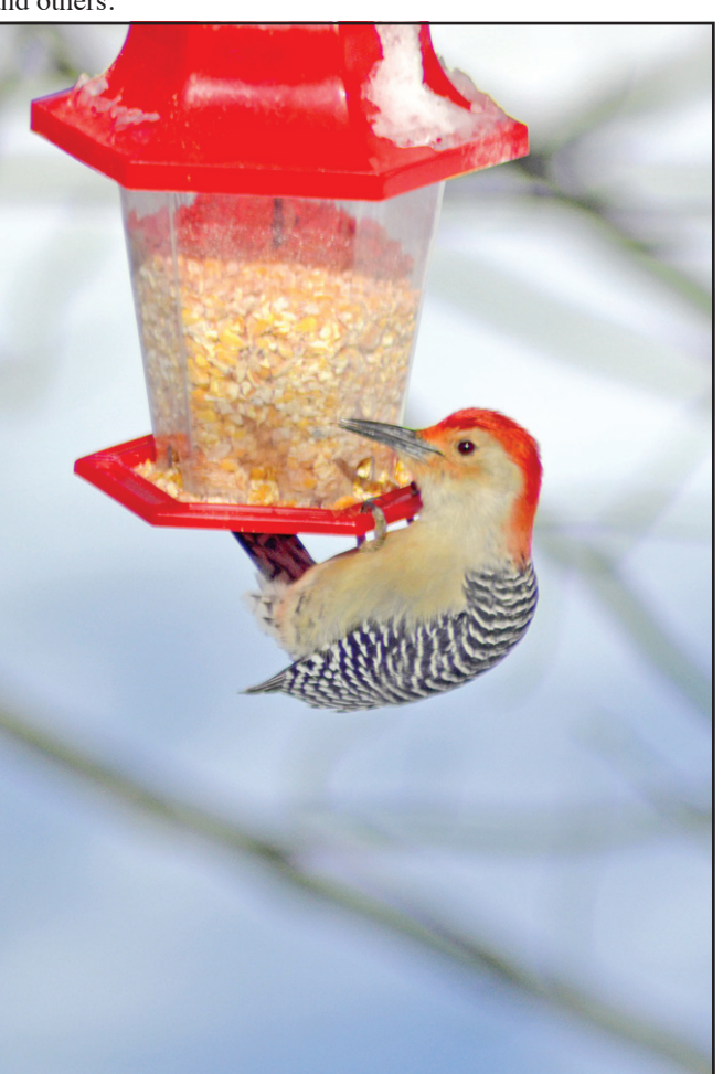
This bird was one of many that had no problem getting out in the snowy environs of Towns County.

As of press time Monday, the Towns County Herald had not heard of any major injuries caused by Winter Storm Helena.