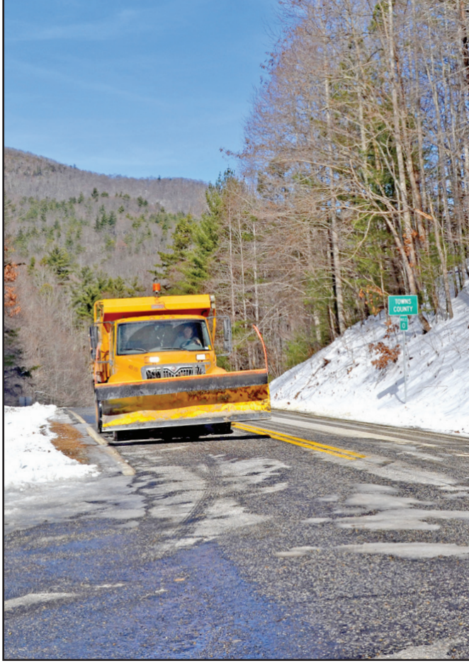
GDOT out scraping roads, here near the Brasstown Bald Visitor Center. The Towns County Road Department also worked around the clock to clear as many roads as possible over the weekend.